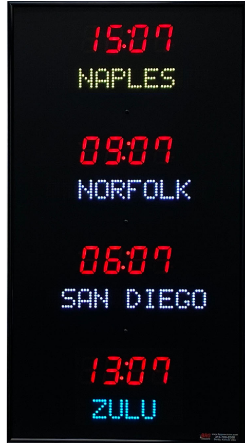
Model 3010B- 1.8" time, 1.2" zone labels, 4 zones